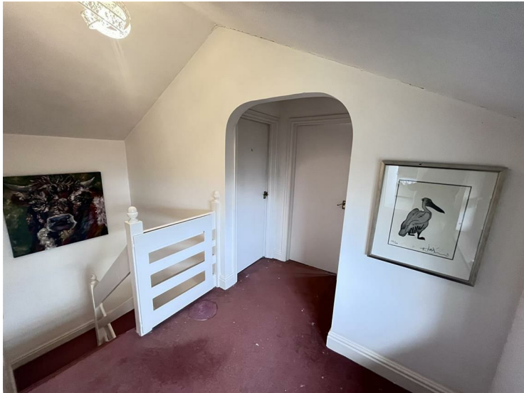
With landing area