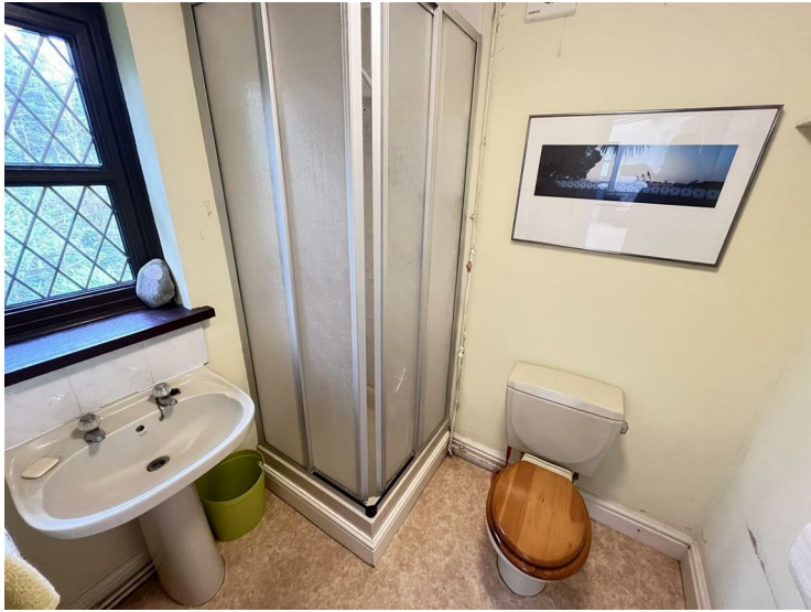
Off the kitchen area. Leading to storage cupboard and shower room, having corner shower cubicle, wash handbasin and toilet.