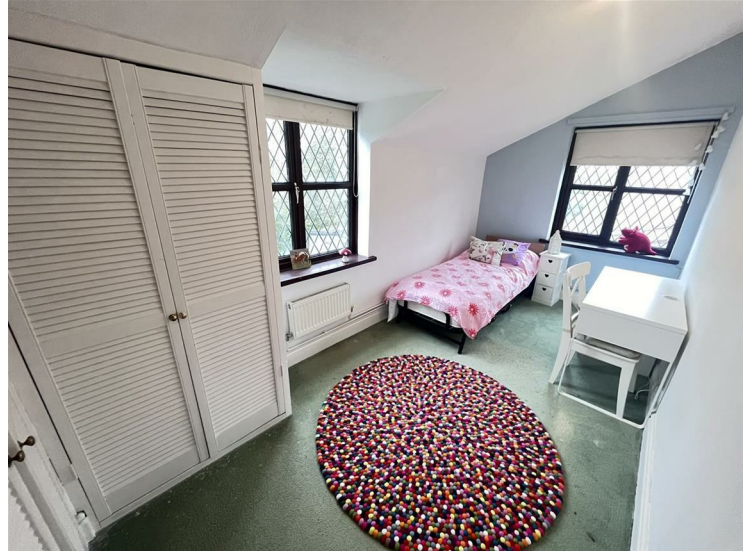
Radiator, built in wardrobe and double aspect windows.