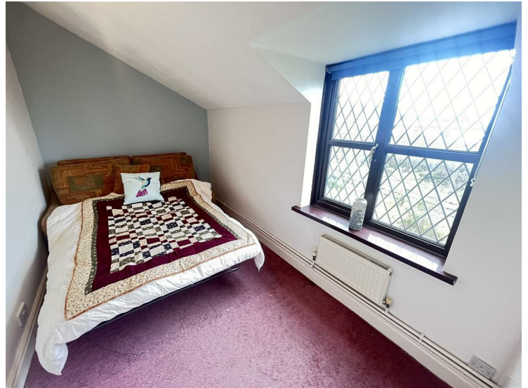
Radiator, built-in wardrobes.